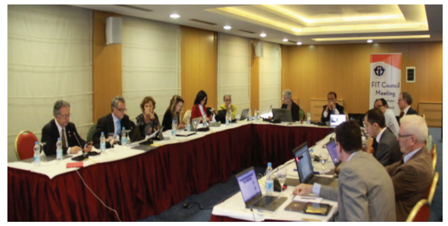
Participants at the FIT Council Meeting in Baku

and the National Association of Judiciary Interpreters and Translators (NAJIT).