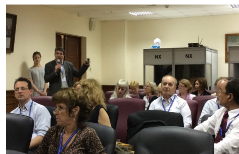
The CIUTI annual general meeting