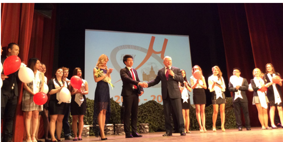
MSU 10 th anniversary gala celebration