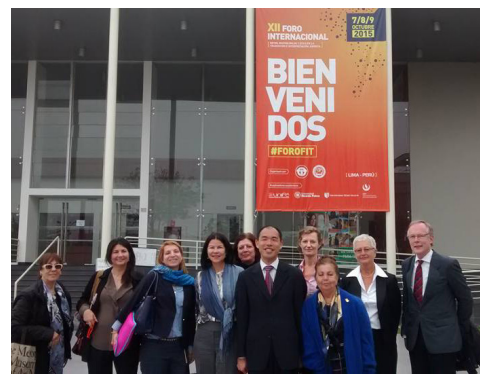
Participants of the FIT LatAm Meeting and FIT Council Members meet on the stairs leading to the Unifé auditorium, on the eve of the FIT Forum

The day closed with the General Assembly of FIT LatAm, which made a review of present accomplishments, most notably, the introduction of a dedicated page for