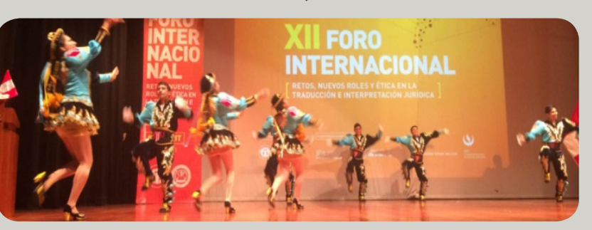
Typical dance performances by university ensembles