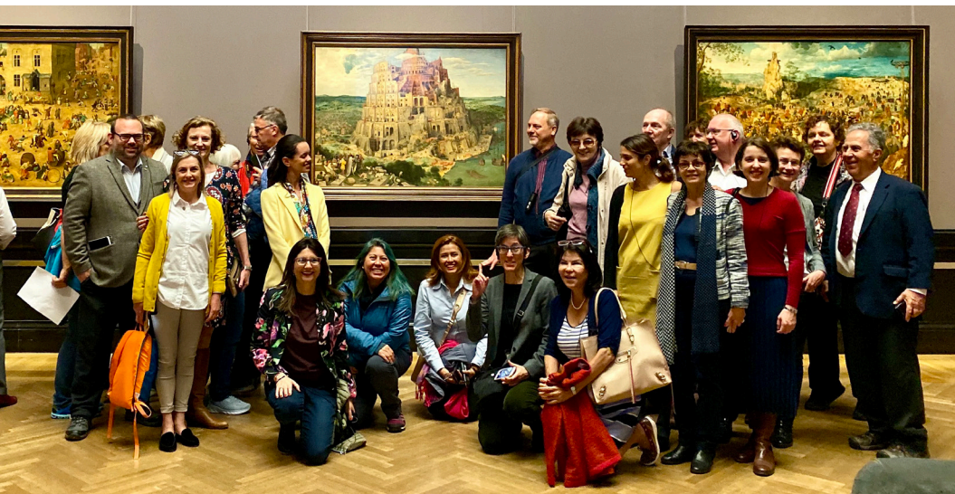
Part of the FIT group at the Art History Museum of Vienna, with Bruegel's Tower of Babel in the background