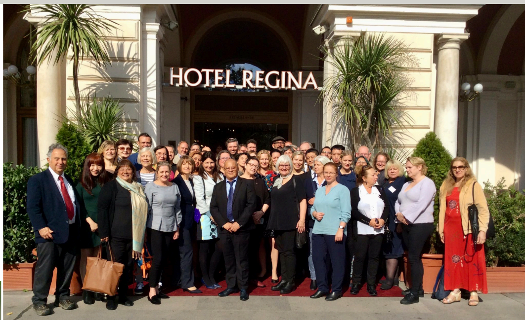
Leaders of FIT member associations at the Presidents Forum held at Hotel Regina, Vienna, on 6 October 2019