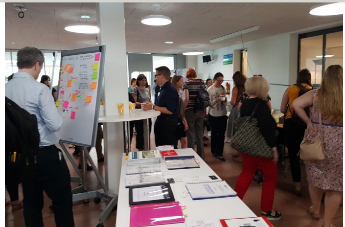
Break and network