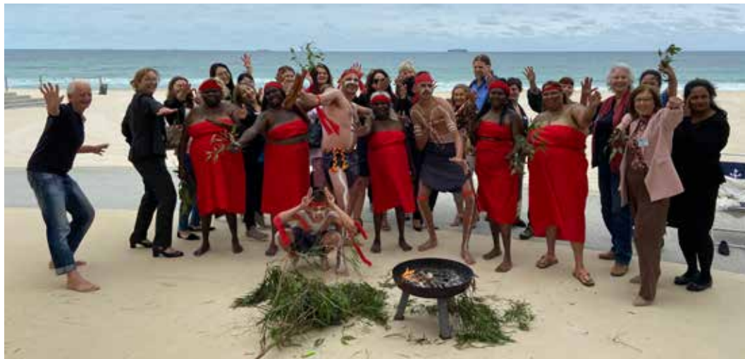
The Noongar Moorditj Minang Jinna men's dance group, AIWA interpreters and Smoking Ceremony fire at AUSIT National Conference 2021