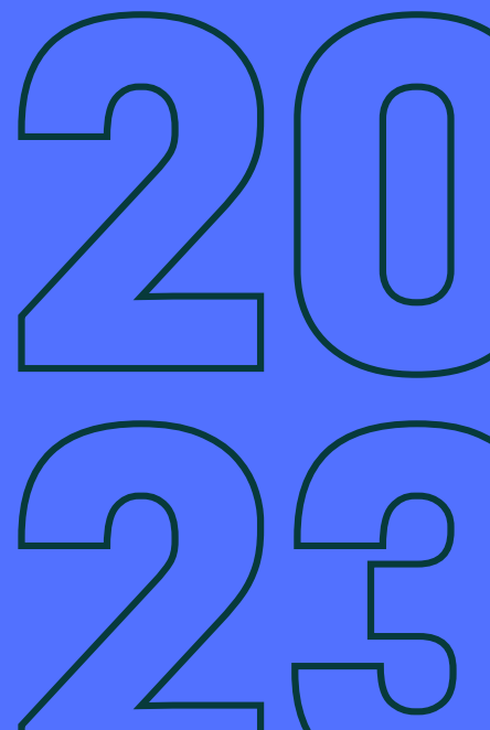
Cover of the report