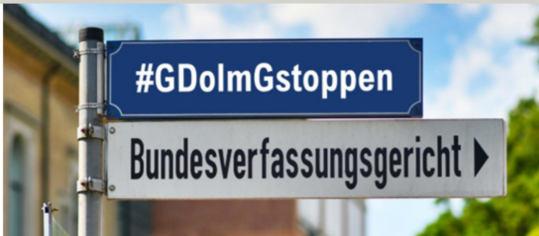
On our way to the German Federal Constitutional Court

Unfortunately, the reasonableness of this aim was matched only by the flawed nature of the ensuing legislative process and, ultimately, the actual GDolmG itself. Contrary to common practice, the Ministry ignored input from relevant stakeholders. Furthermore, Ms Lambrecht did not permit any discussion of the criticism expressed by professional language associations, nor did she ensure thorough preparation before enacting the bill. When the bill reached Germany's second parliamentary chamber, the Bundesrat, things got even worse. Although Bundesrat lawyers